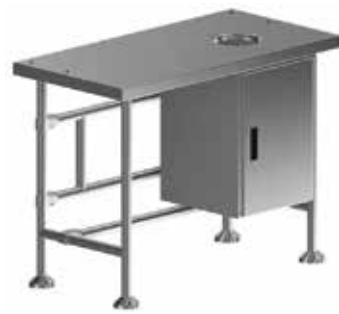
Wipe Down Table