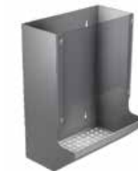
Eye Glass Dispenser