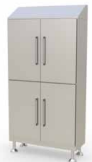
Cleanroom Cabinets Unique Cleanroom Cabinets – shipped flat packed, reducing shipping costs and preventing damage during transport.