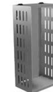
Folded Gown Dispensers