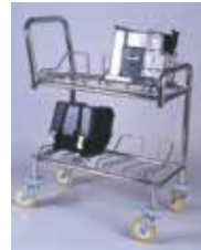
Cleanroom Carts Wide variety from Utility to specialized wafer transportation