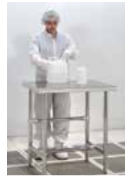
Cleanroom Workstations Featuring Ergo & Heavy Duty Designs

We also have a growing customer base from Universities, Medical Device & Nanotechnology cleanroom users.