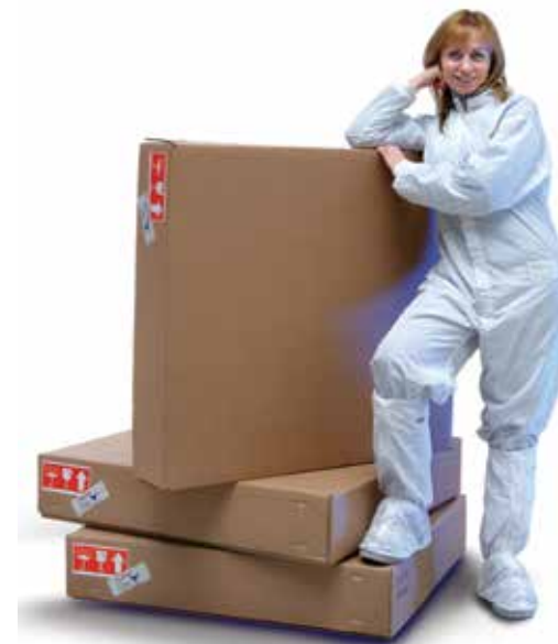
Flat Packed Many Products designed to be shipped flat packed reduces delivery costs & minimizes damage in transit.

To view the entire range of Palbam Class products for Cleanrooms we welcome you to visit our website at www.palbamclass.com