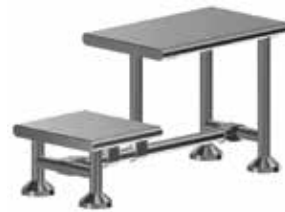
Swing Over Bench