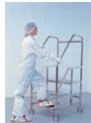
Cleanroom Step Ladders Ergonomic with unique retractable casters