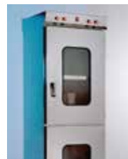
Desiccators & Dry Storage N2 & Desiccant solutions for low humidity storage of sensitive components