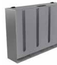
Sterile Glove Dispensers