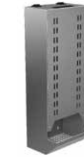
Gown Hood Dispensers