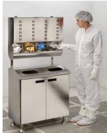
GD-8060 fits above the Final Glove Cabinet - see page 45